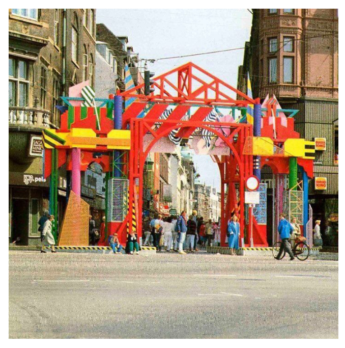
Figure 4. Ernst lohse. Western Gate of Copenhagen, photograph (1985).

others. Nevertheless, the tenets of the Black Metal scene are echoed by Lohse's own words, which, in Our Construction Should Be Based in the Irrational, point to "the welfare state's fantastic propaganda of happiness, a driving interest in therapy, and new religious movements," as symptoms of the disease of soulless Modern architecture that plagues Scandinavia.(19) Lohse also critiques the myth-less quality of contemporary Christianity, writing, "the new churches resemble factories. Or rather, the factories resemble the churches: with their chimneys reaching into the sky, they are far more sacred than the churches of today."(20)